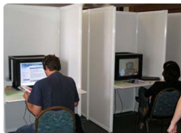
MIFA digital video library