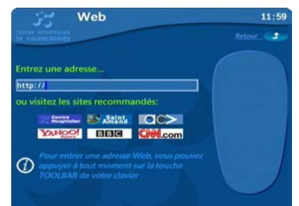
Web on TV