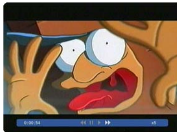
Video control features