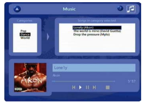
Playing of a Juke-Box song